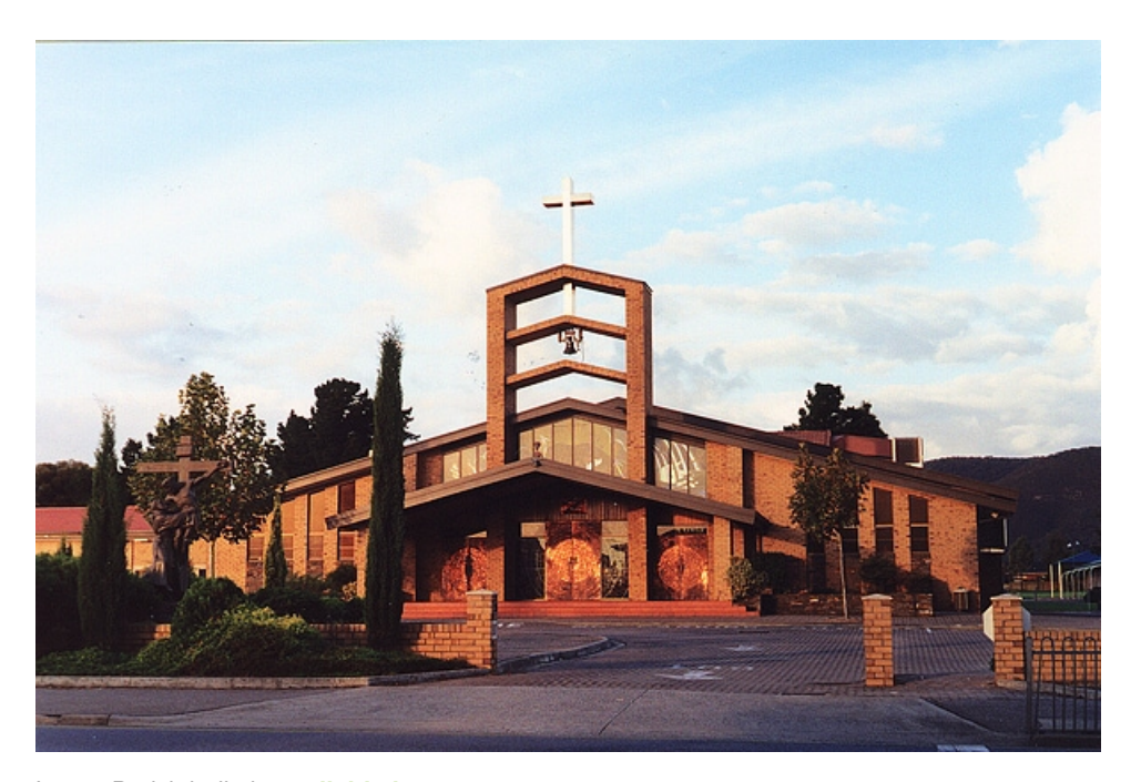
Latest Parish bulletin available here